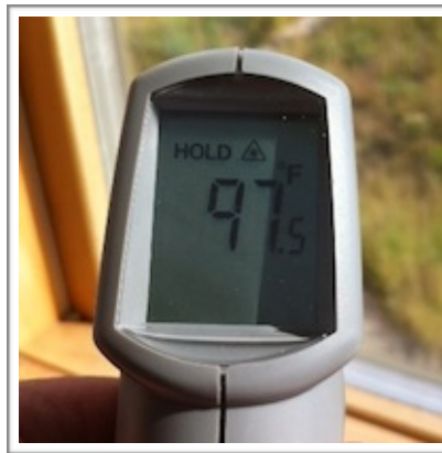
Interior, between a shade and a window.