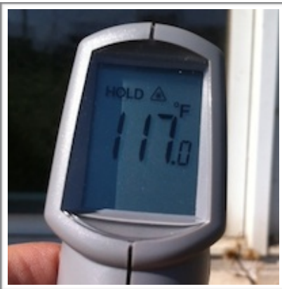
South facing window in the sun.

A Raytek® MiniTemp™ infrared thermometer was used.